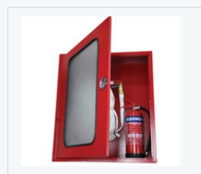
Hose Rack Cabinets