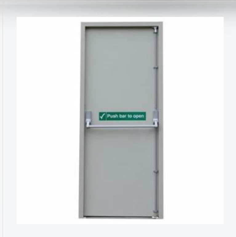
3 Hours Fire Rated Doors

شركة المحابس الأردنية للتجارة Jordanian Valves Co.