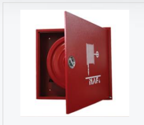
Single Door Cabinets