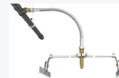
Flexible Sprinklers Connection