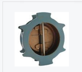
Wafer Check Valves