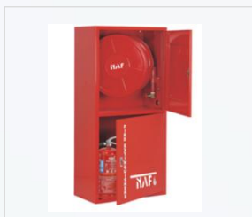
Double Compartment Cabinets