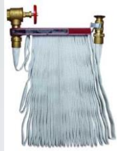
Hose Racks (1 1/2")

شركة المحابس الأردنية للتجارة Jordanian Valves Co.