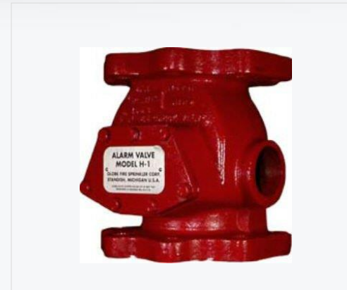
Alarm Check Valve