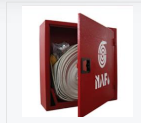
Hydrant Hose Cabinets