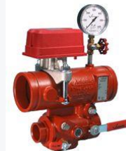
Zone Control Valve