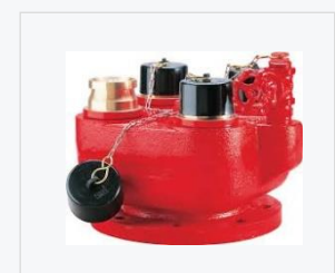
Breeching Inlet (Siamese)