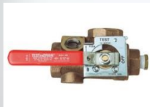
Test & Drain