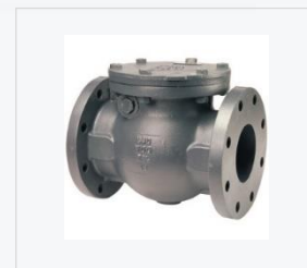
Swing Check Valves