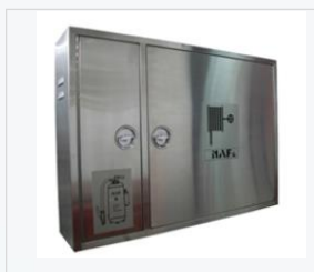
Stainless Steel Cabinets