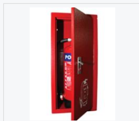
Fire Extinguisher Cabinet