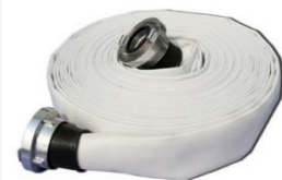
Hydrant Hose(2 1/2")